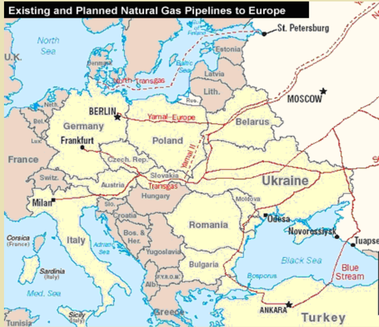
Existing and Planned Natural Gas Pipelines to Europe